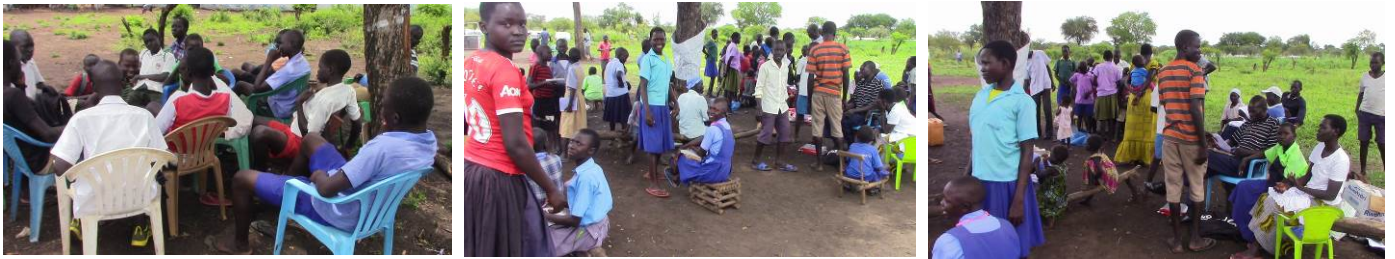
A good number of pupils have not reported in the second day. Teachers were found busy giving out report forms and marked scripts to those pupils who have reported.