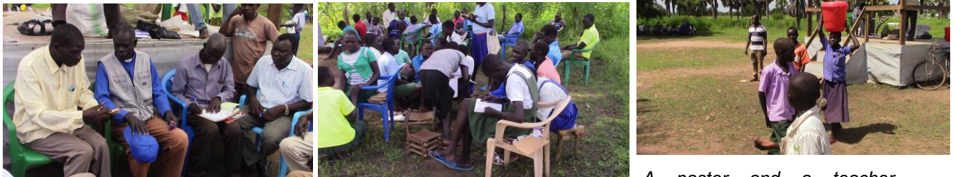
A pastor and a teacher confirming the advance for local purchases. The pupils are checking their marked scripts and getting reports for last term. A P4 pupil was found carrying drinking water for her colleagues.