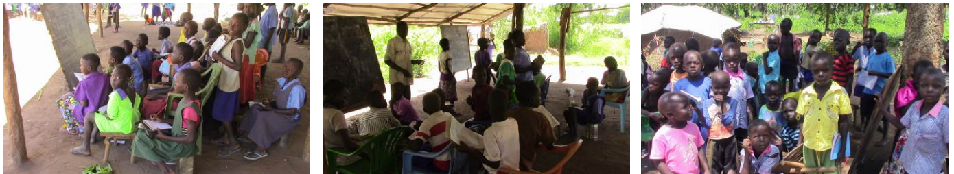
The star of Bethlehem School is the most affected in terms of numbers of pupils who have reported. Irrespective of the few numbers, some of the teachers are teaching the few who have reported which is a good thing.