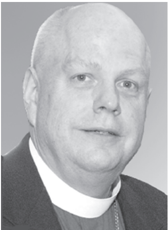
Bishop Paul Marshall

Living out one's baptism as well as one can is the only thing